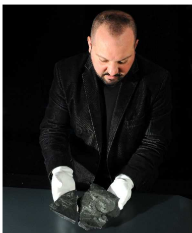
Die „Gabonionta“ in Natural History Museum Vienna