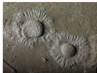
Two fossils on a slab showing the typical central body and fringe; width c. 5 cm