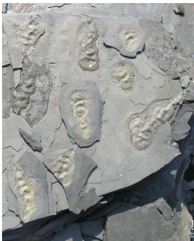
Slab with numerous specimens; width 30 cm