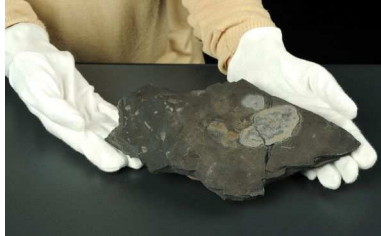
Die „Gabonionta“ in Natural History Museum Vienna