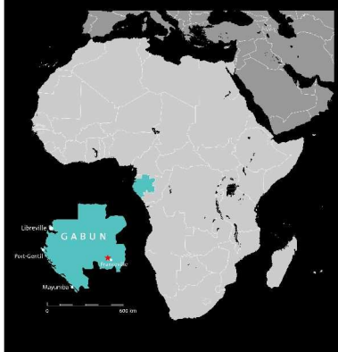
The quarry close to Franceville in Gabon.