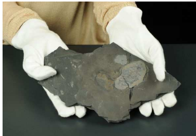
Die „Gabonionta“ in Natural History Museum Vienna