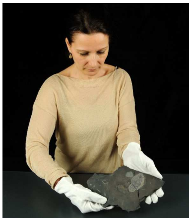
Die „Gabonionta“ in Natural History Museum Vienna